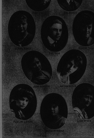
GRADUATING CLASS OWENSMOUTH HIGH SCHOOL